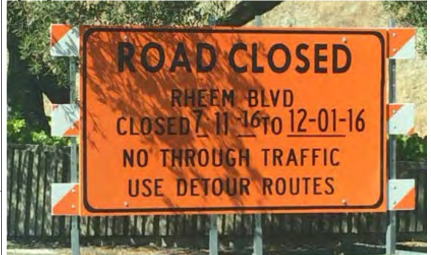
The sign says it all: Rheem Boulevard will be closed longer.

heem Boulevard south of Moraga Road will be closed until December, a month-and-a-half longer than the Town of Moraga originally anticipated.